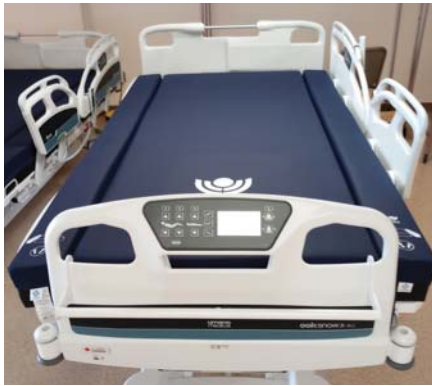
Cuddle bed in expansion mode