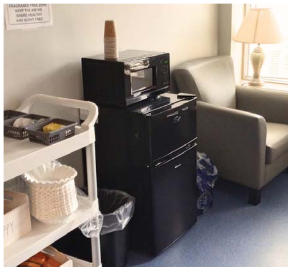
Microwave on top of fridge in family room

The easing of visitation restriction at the hospital resulted in more family members visiting patients at end-of-life at one time, causing temporary seating shortages within the specific hospice rooms. To accommodate the families, 6 folding chairs were purchased by the Society. The chairs are placed in storage when not needed. In addition, other small items purchased for 4N include a microwave, a shaver, and a landline phone for use by patients and families. The items, though minor, have been well appreciated by family members.